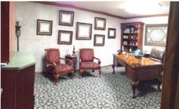
Main Office - 12x20