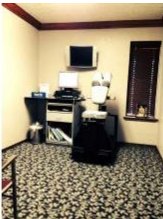
Office - 9x12