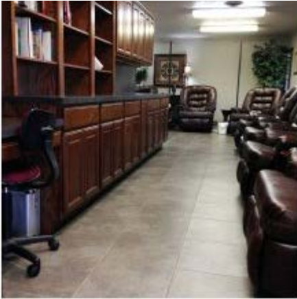
Patient Room with Cabinets