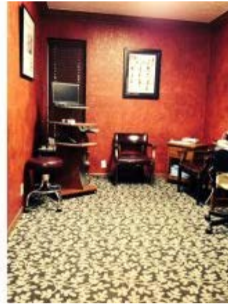
Office - 9x12