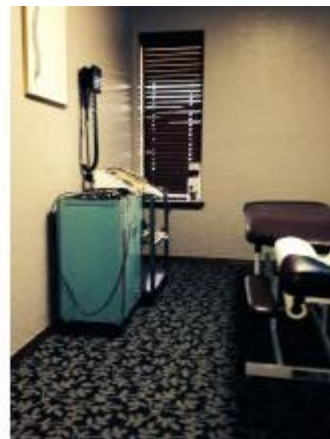
Office - 9x12

- - - - Information herein deemed reliable but not guaranteed - - - -